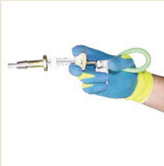
Squeeze to open