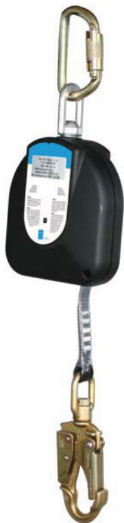
SRL 20ft Webbing

Next Safety provides an in-house repair service and all Skywire SRLs are recertified in-house by factory trained technicians, saving you time and money. Next Safety carries all parts for the Skywire SRLs including replacement housings, ferrules and wire rope, thus reducing your cost of ownership and maintenance.