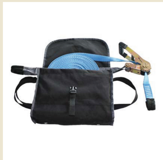
Temporary Horizontal Lifeline