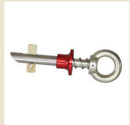
Release to lock