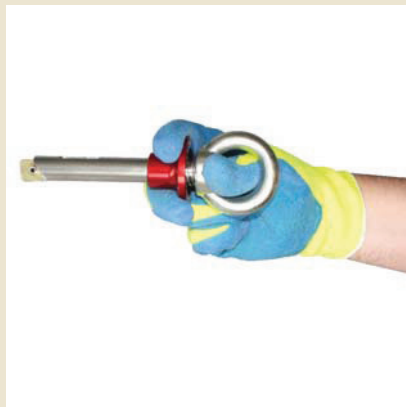
Squeeze to open