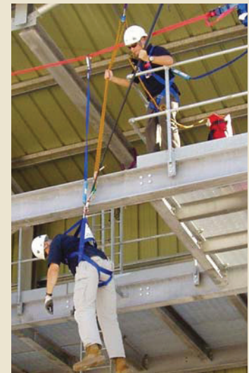
Suspension Trauma Straps