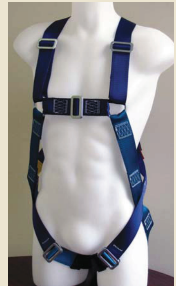
Leading Edge Harness RGH1