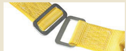
Easy Slot Buckles