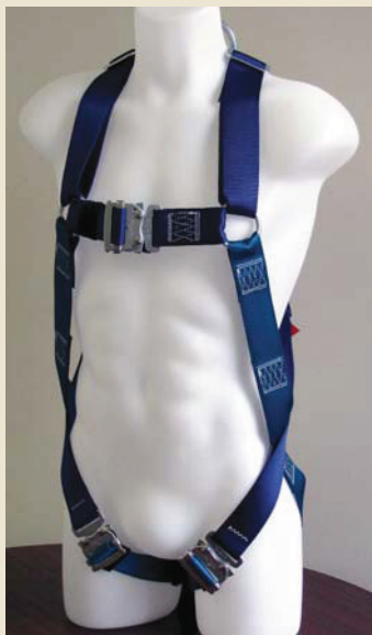
Leading Edge Harness RGH1QC