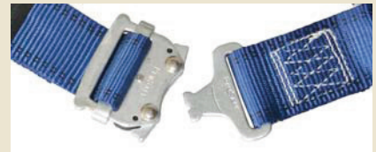
Quick Connect Snaps