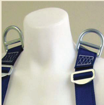
Shoulder D-rings for rescue