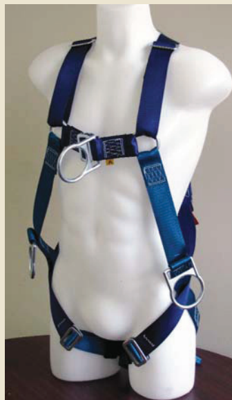
Leading Edge Harness RGH4