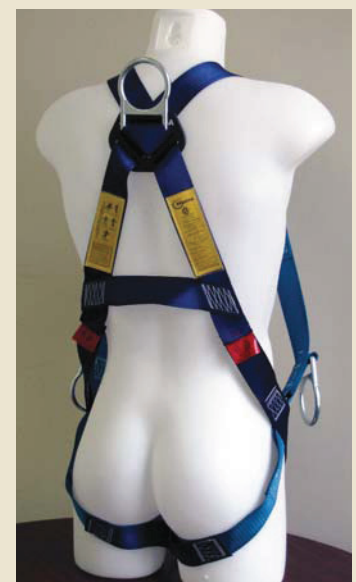
Leading Edge Harness RGH3

Company names and logos can be added across the back of this harness. Please call for details.