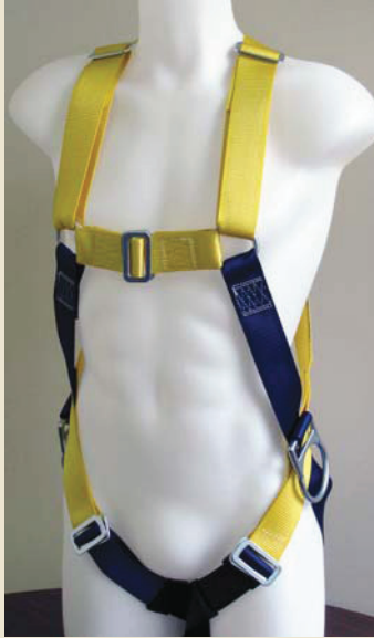
Contractor Harness RGHE3