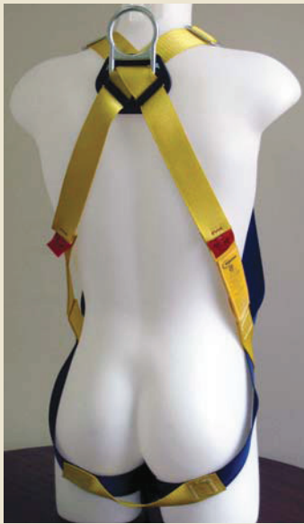
Contractor Harness RGHE1