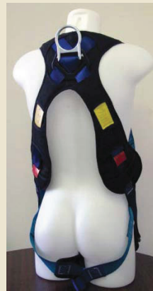
Leading Edge Harness with Comfort Pads